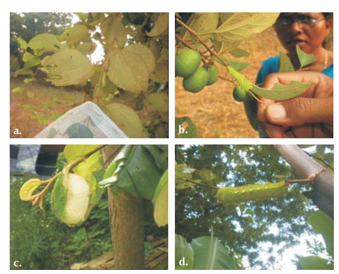
Figure 1: a. Brushing of silkworm in Z. mauritiana , b. Feeding of silk worm in leaves, c. Formation of silkworm coccons, d. Matured silk

condition has also an important role in addition to food plants (Yokoyama, 1962) for success of tasar crop. The autumn cocoon crop is better in comparison to rainy, may be due to favorable temperature, humidity, photoperiods and no. of rainys day less than rainy season. Secondly, rearers were habituated with Asan (T. tomentosa) plants available in forest due to bushy and non thorny nature. However, due to deforestations (primary food plants were severely cut by wood cutter for its high fuel value), silkworm rearing is badly affected for shortage of food plant especially in autumn crop. They can use Ziziphus mauritiana as substitute food plants for conducting silkworm commercial rearing (Deka et al., 2013). Rearers can use Ziziphus mauritiana for commercial exploitation as the period do not favour flower and fruiting in the plant and leaf is fully matured for crop. Lot of Ziziphus plants are available in Similipal Biosphere which can be exploited for tasar rearing to achieve better crop and best